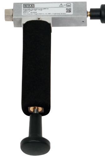
Pneumatic hand test pump model CPP7-H

If one connects the test item and a sufficiently accurate reference measuring instrument to the hand test pump, on actuating the pump, the same pressure will act on both measuring instruments. By comparison of the two measured values at any given pressure value, a check of the accuracy and/or adjustment of the pressure measuring instrument under test can be carried out. In order to approach the measuring points exactly, the hand test pump features a fine adjustment valve.